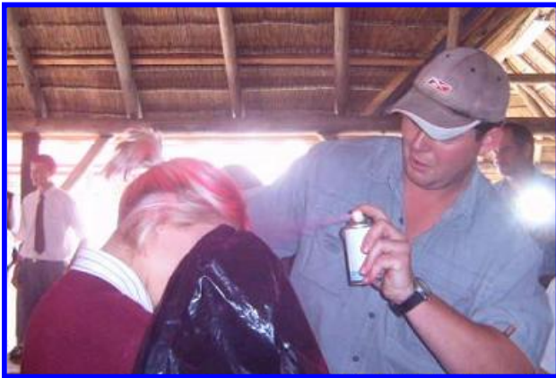
Kroonstad Rotaract Club members assisting with the CANSA Shave-athon

The Rotaract News is a way for Rotaract Clubs to keep in touch with one another, share project ideas & lessons learnt, and build a stronger Rotaract District.