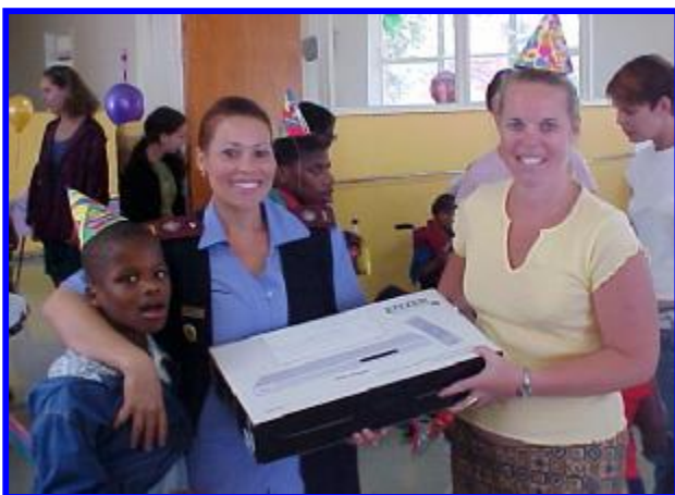
Party at the Algoa Frail Care Centre