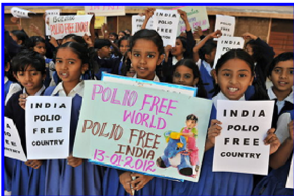
School children hold placards during a polio awareness campaign at the Saint Francis girls high school in Secunderabad, Andhra Pradesh.

Please make your club contributions before the end of March.