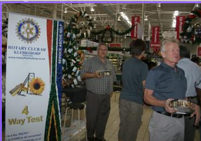
Clockwise from top left: Young beneficiaries of the East London Rotary Club; Rotarians from Kimberley South distributing gifts; and the Rotarians of the Rotary Club of Klerksdorp at their Tree of Joy project