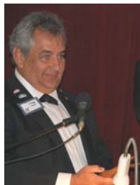
See the buck in his hands.....