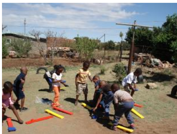
Projects bring help and fun to the young.